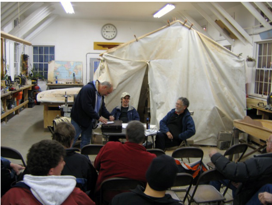
TOP Outside the meeting room, BOTTOM January 5th Club meeting.

Let us know what's happening! Send photos, stories, race results, classifieds. We'll put it in the Newsletter.